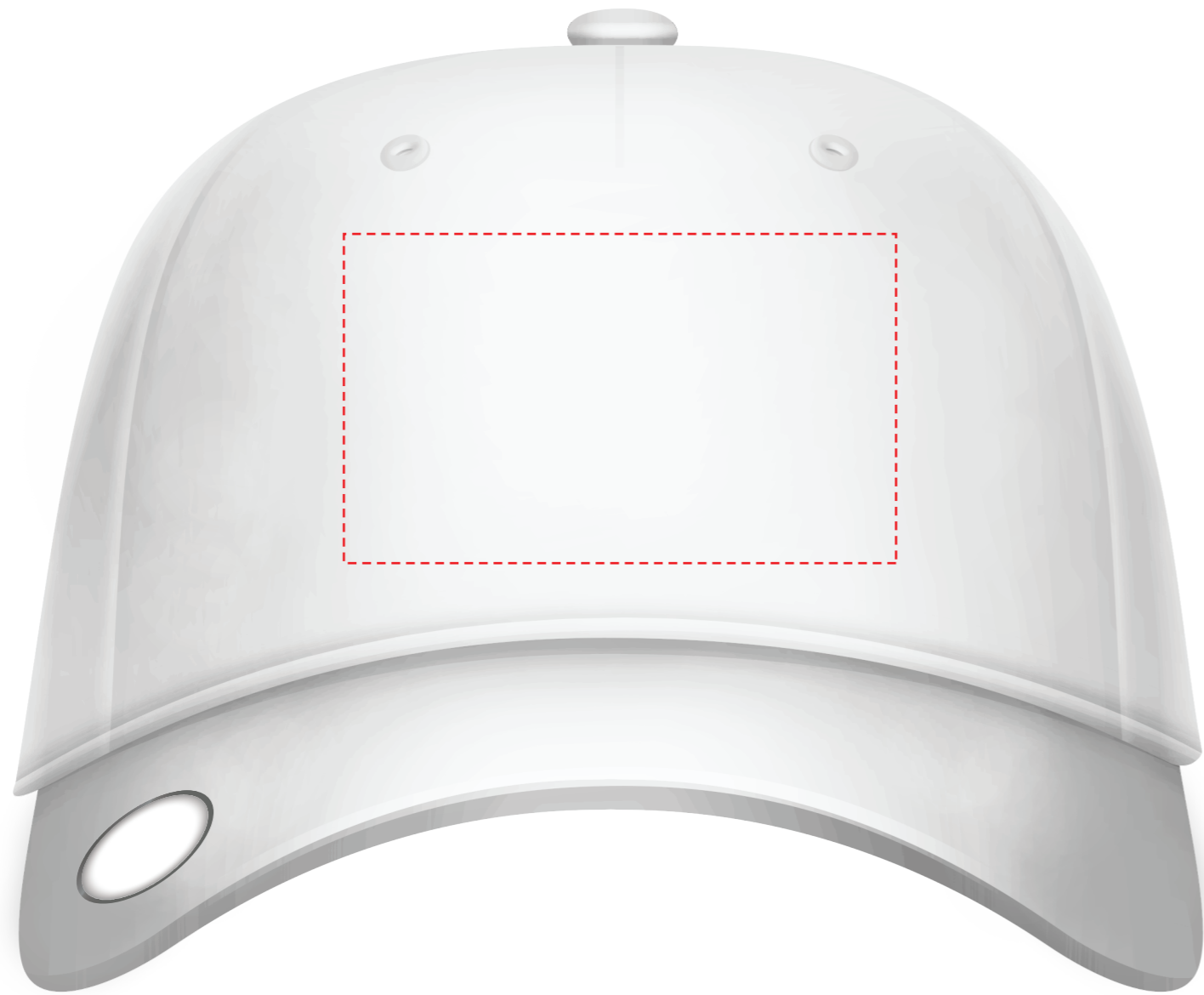
Resin Dome Ball Marker Actual Size