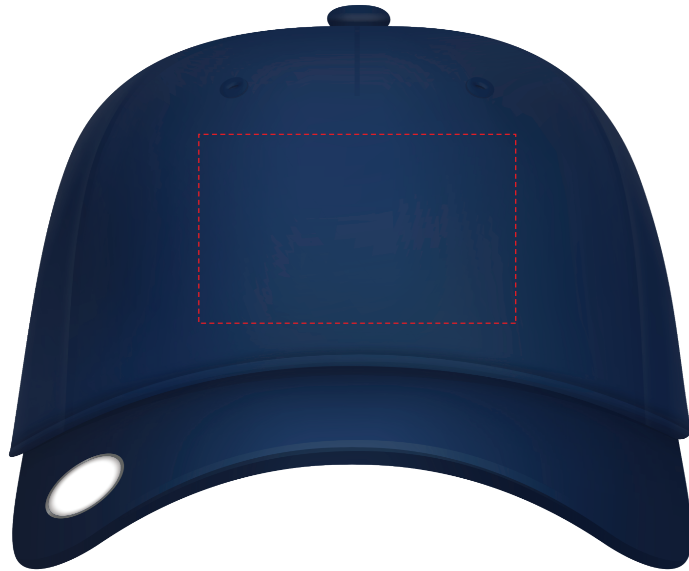
Resin Dome Ball Marker Actual Size