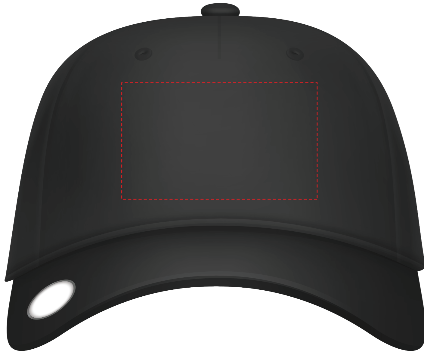
Resin Dome Ball Marker Actual Size